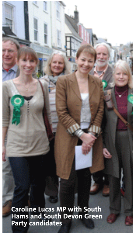
Caroline Lucas MP with South Hams and South Devon Green Party candidates

To take part, visit our website - southwest.greenparty.org.uk