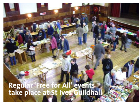
Regular 'Free for All' events take place at St Ives Guildhall